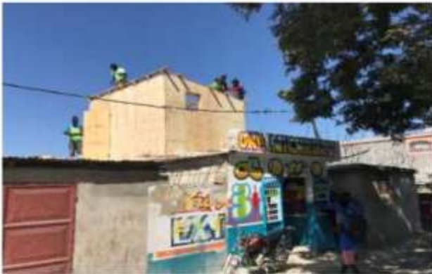
House construction "High Rise"