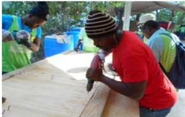
Workers assembling doors for houses and latrines