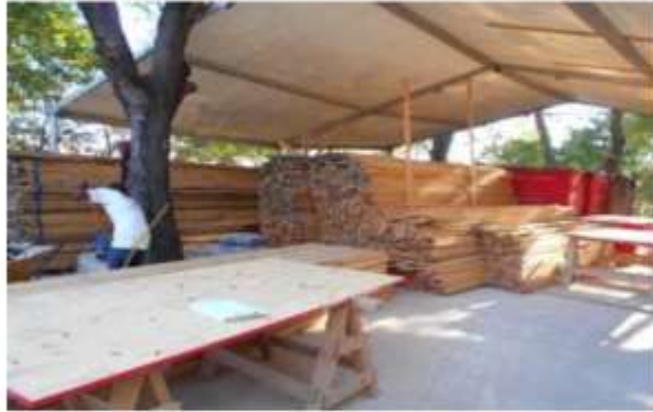
Lumber for houses & latrines