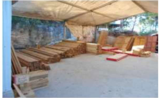
Staging area for the pieces for the houses