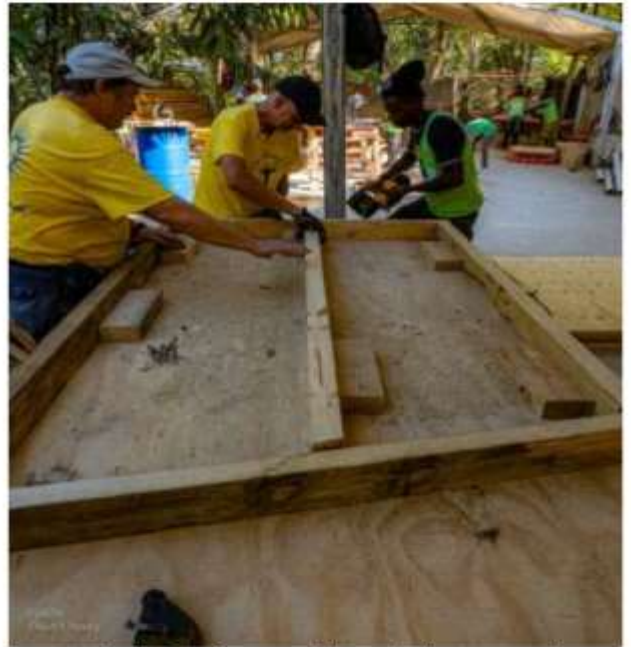
Make shift jig for assembling the latrine panels