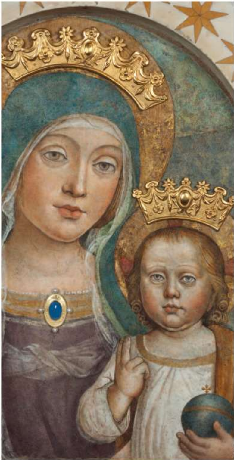
The ancient fresco of Madonna del Soccorso (Our Lady of Help) in St. Peter's Basilica was restored with the support of the Knights of Columbus to mark the Year of Faith (2012-2013).

O Mary, you always brighten our path as a sign of salvation and of hope. We entrust ourselves to you, Health of the Sick, who, at the Cross, took part in Jesus' pain while remaining steadfast in faith.