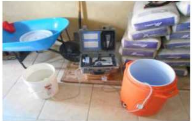
Making chlorine to purify water