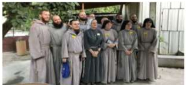
Brothers and Sisters