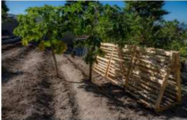
Garden with trellis's