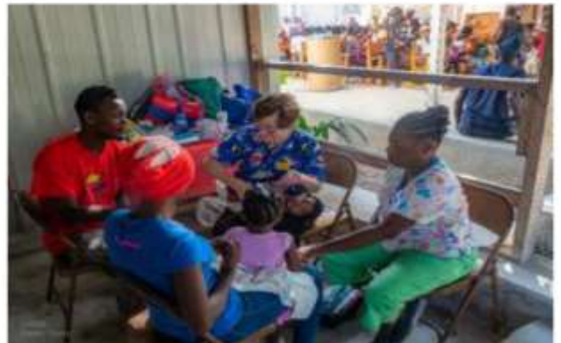
Clinic – Nurse assessing child through translator.