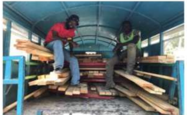
Free house loaded on the truck