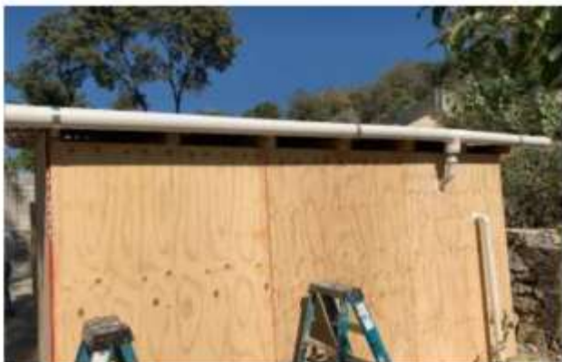
Gutter to collect roof water