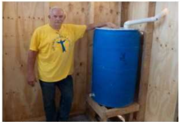
Barrel to collect roof water, inside the house