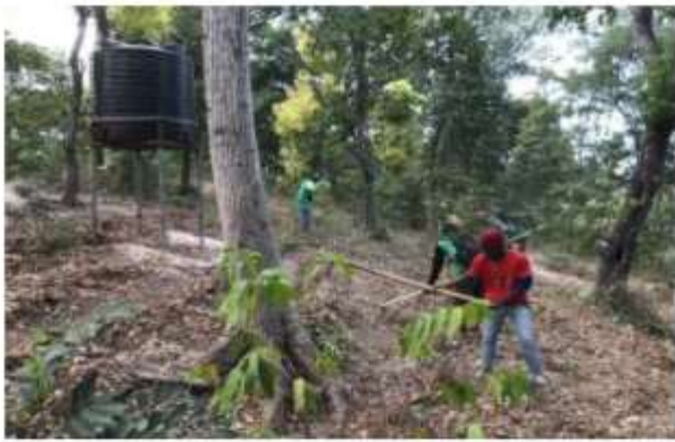
Clearing for the garden